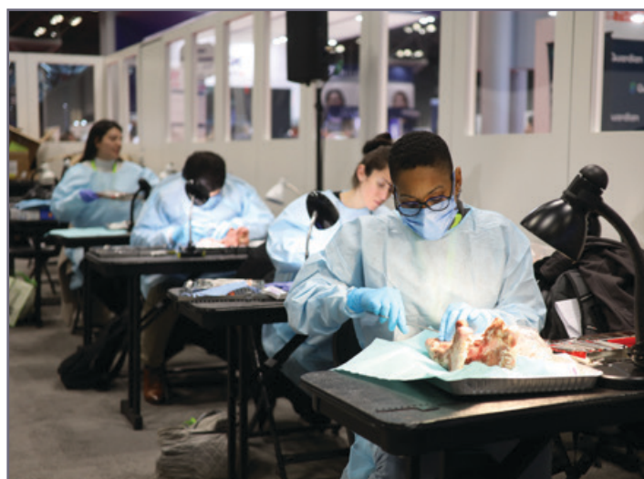
Attendees participate in one of the numerous hands-on workshops at the 2024 GNYDM