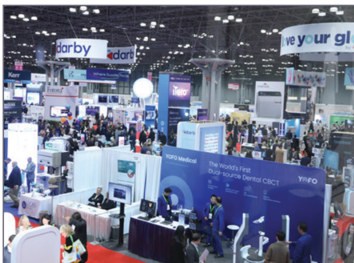
A view of the expansive 2024 GNYDM exhibit floor

Contact Us: info@gnydm.com www.gnydm.com @GNYDM #GNYDM