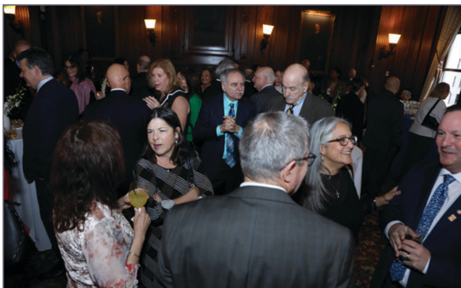
Guests at the SDDS Installation of Officers Luncheon mingling with their colleagues during the cocktail hour