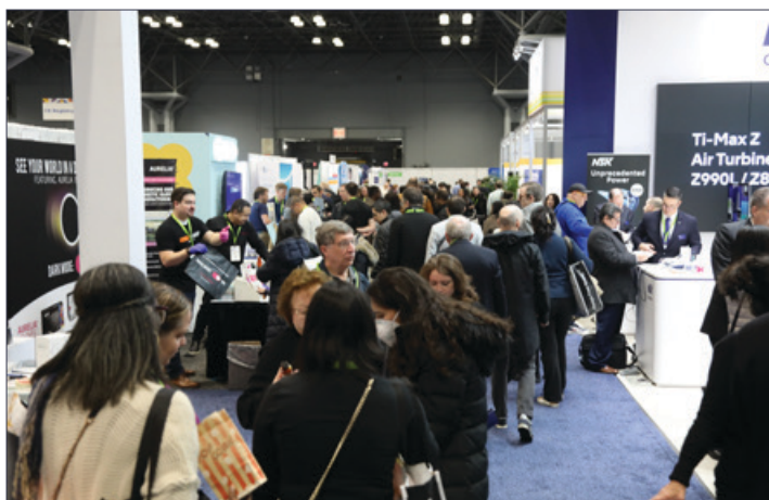
A view of the 2023 GNYDM exhibit floor