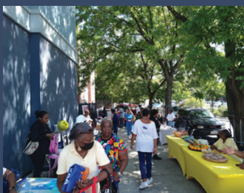
Bed-Stuy community members attending health fair attentively engaged in tabletop presentations