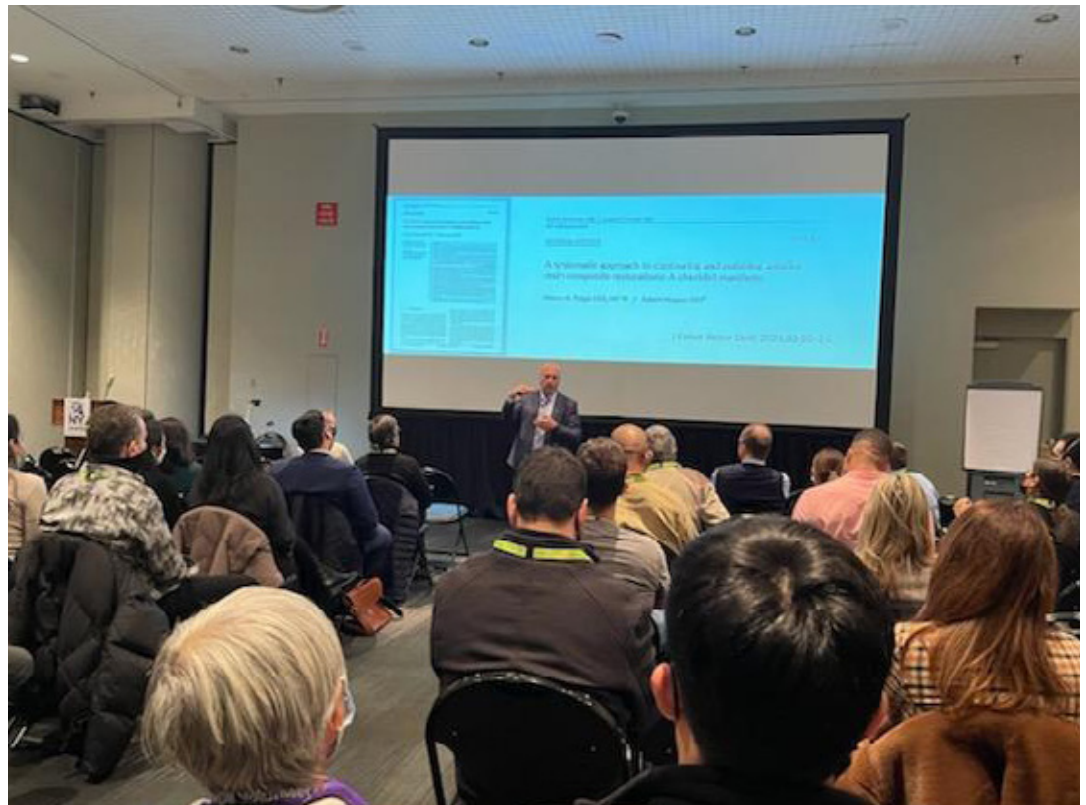
GNYDM attendees participating in lectures and hands-on workshops