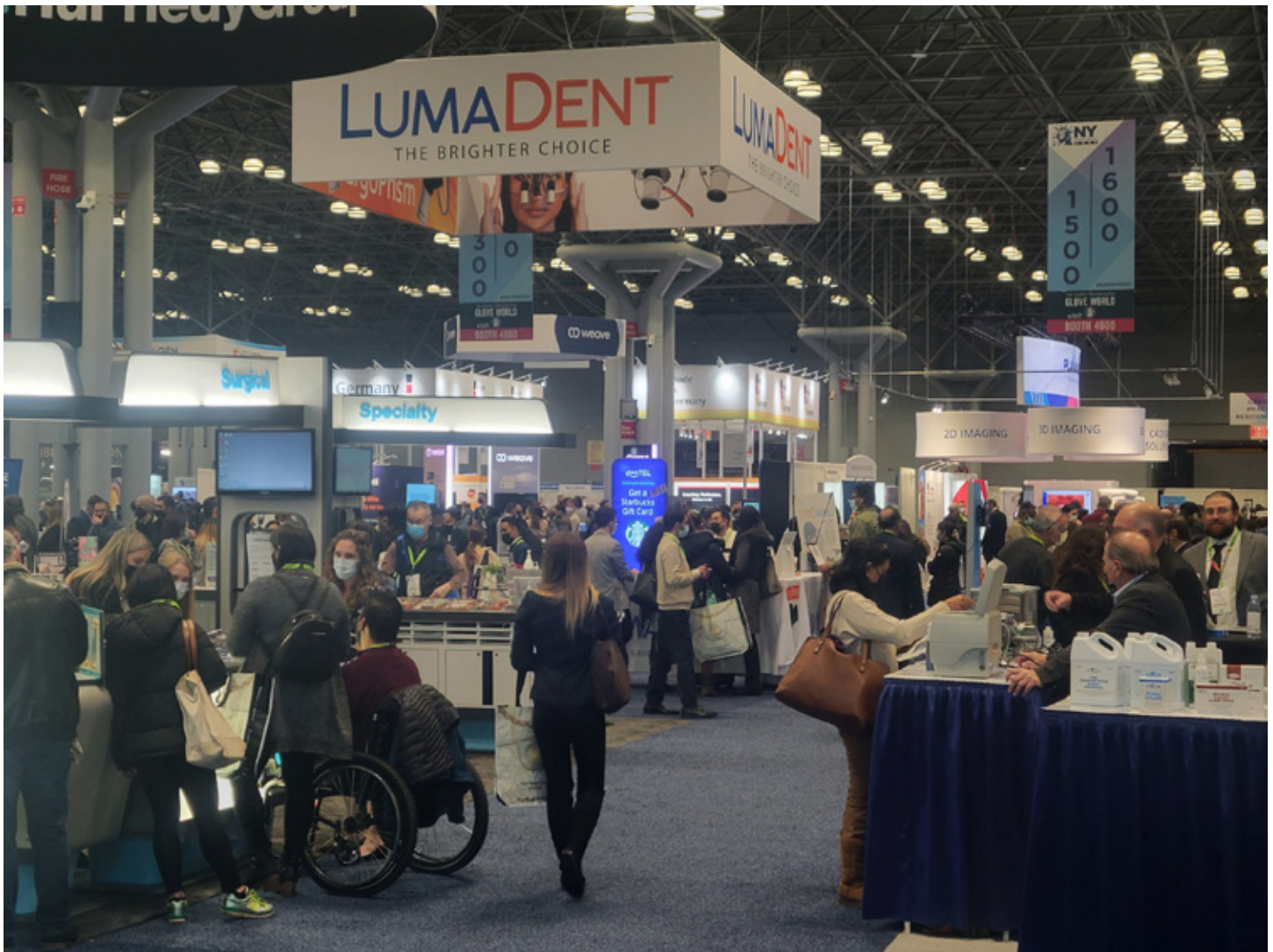
The exhibit floor at the 2021 GNYDM

The GNYDM continues to expand its specialty meetings, including nine in 2021: World Implant EXPO, Global Orthodontic Conference, Pediatric Dentistry Summit, Sleep Apnea Symposium, 3D Printing & Digital Dentistry Conference, Public Health Symposium, Oral Cancer Symposium, Special Care Dentistry Forum, Women Dentists Leadership Conference and the GNYDM Lab Symposium. The specialty meetings each continue to increase attendance